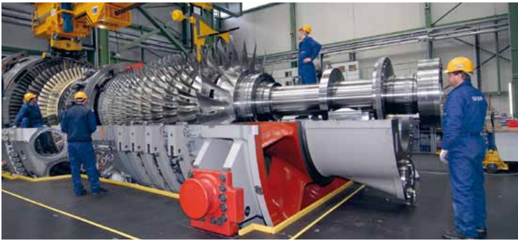
Gas turbine, Siemens AG

The research initiative “Power Plants of the 21st Century” is a joint initiative of the federal states of Bavaria and Baden-Württemberg with 50% involvement on the part of industry partners. It started on 1 January 2009 in the second 4-year phase.