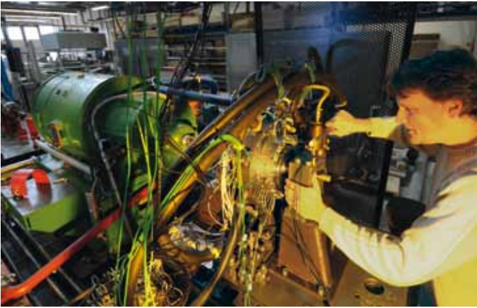
Trial installation for experimental determination of rotor-dynamic characteristics of steam turbines