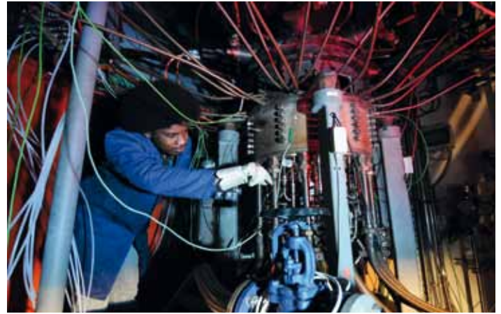
Annular combustion chamber test station