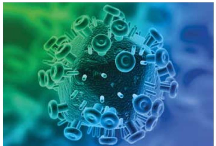
Model of a retroviral vector.

Development of new methods for the diagnostics and therapies of bacterial, viral and fungal infections.