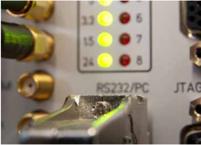
Control technology as an important factor in the food supply chain