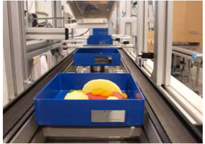
Transport box in the demonstration system for cooking at the push of a button