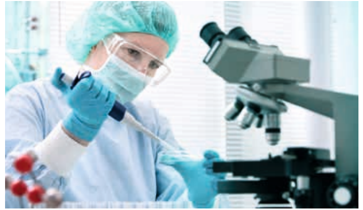
The determination of antibiotic resistency profiles in vitro and in vivo is one of the major goals of ForBIMed (49399692 © Alexander Rath - fotolia.com)

Replicon-Technology for Assessment and Production of Adenoviruses with a High Security Profile