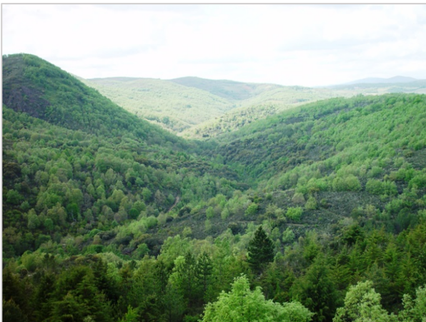
Pyrenean oak (Quercus pyrenaica) woodlands in the Serra da Nogueira.

There are no public forests (state or local government) in this region, but around 11.5% of forests are in communal areas. Woodlands are often small and dispersed, with an average area of 0.7 ha. The number of forest owners in the region is unknown, but it is likely to be very large given the very small average size of property.