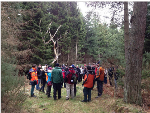
The SIMWOOD partners on a site visit in Northumberland, UK in February 2015.

This four-year project seeks to provide solutions on how to mobilise forest owners, promote collaborative forest management and ensure sustainable forest functions in order to mobilise the present unlocked wood resources in Europe.