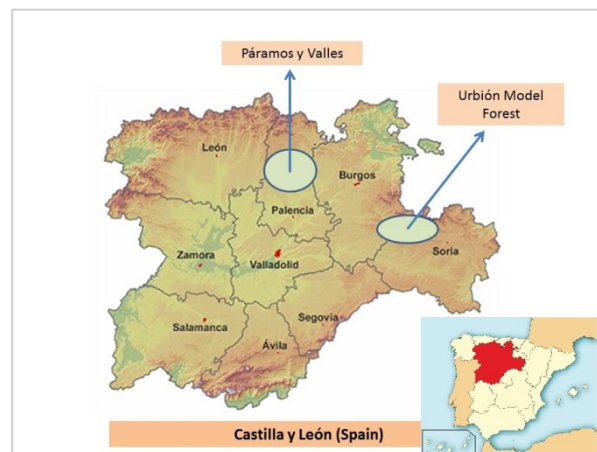
Map of location of study areas in Castilla y León region

industry, but with difficulties in maintaining the economic activity of traditional enterprises. The Páramos y Valles area has a relatively young forest and recently began to exploit its resources.