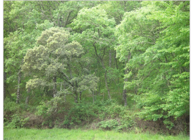
Mixed woodland in the Vinhais municipality.

commercialization of chestnuts (fruit) with a relatively high price and high national and international demand.