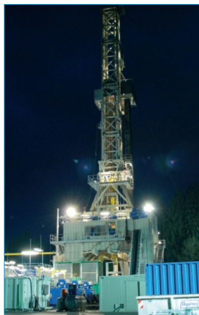
Drilling tower of the geothermal project "Geretsried-Nord" situated south of Munich in order to extract geothermal water for thermal energy and power generation (Gerold Diepolder) ■

level. Emphasis is placed on an integrated approach that incorporates, for instance, both the sustainable use of regional building materials and renewable energies. To this end, AlpBC aims to sensitize and qualify regional participants with regard to this topic. The EU is providing approx. EUR 2.1 million over a 34-month period for the project that is being coordinated by the Chamber of Trades and Crafts for Munich and Upper Bavaria.