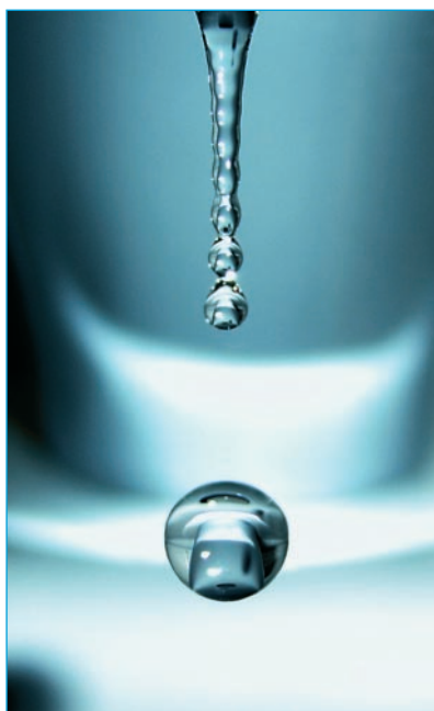
Close-to-market innovations in the water sector play an important role for the EU ■

The European Commission sees SMEs as an innovation driver which can swiftly turn research results into marketable products and by doing so create new jobs. This is reflected in the layout of the funding programme and the higher rate of funding: Twenty percent of all funding is earmarked for SMEs in the aforementioned pillars 2 and 3 (industrial leadership and/or societal challenges). Seven percent is tied to an area that can only be utilized by SMEs. The new SME instrument that has been established as