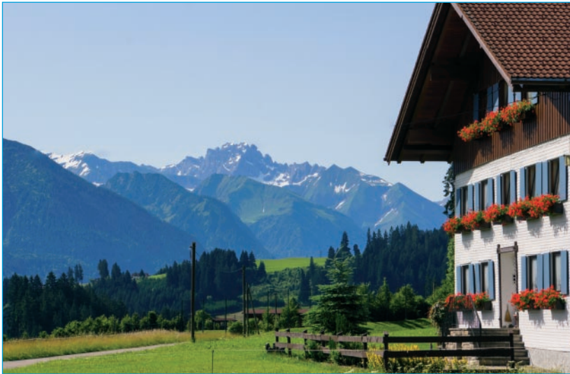
AlpBC: preservation and development of alpine building culture ■

years now, are good examples of just some of the exciting fields that receive European research and innovation funding. BayFOR has supported scientists and companies in their efforts to identify suitable funding options and in the filing of applications and implementing projects.