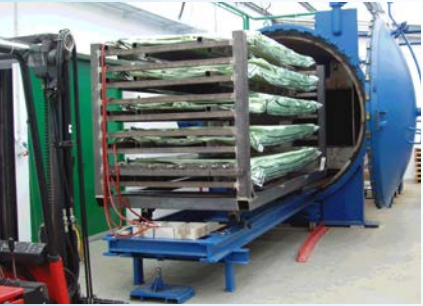
Production of laminates using an autoclave at InGlas Produktions GmbH

Within the FP7 Energy Efficient Buildings program (EeB) novel materials for smart windows conceived as affordable multifunctional systems offering enhanced energy control will be developed. The aims are measurable and enhanced energy control, low embodied energy and high durability, broad applicability to hot and cold climates, and observing sustainability principles. Such new windows have to offer easy installation, realistic solutions at reasonable price, adequate luminosity, light transmittance, lighter weight, glare control, thermal inertia, thermal comfort and noise reduction.